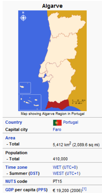
Fig. 1. Mediawiki infobox syntax for Algarve (left) and rendered infobox (right)

{{Infobox settlement | official_name = Algarve | settlement_type = Region | image_map = LocalRegiaoAlgarve.svg | mapsize = 180px | map_caption = Map showing Algarve Region in Portugal | subdivision_type = [[Countries of the world|Country]] | subdivision_name = {{POR}} | subdivision_type3 = Capital city | subdivision_name3 = [[Faro, Portugal|Faro]] | area_total_km2 = 5412 | population_total = 410000 | timezone = [[Western European Time|WET]] | utc_offset = +0 | timezone_DST = [[Western European Summer Time|WEST]] | utc_offset_DST = +1 | blank_name_sec1 = [[NUTS]] code | blank_info_sec1 = PT15 | blank_name_sec2 = [[GDP]] per capita | blank_info_sec2 = €19,200 (2006) }}